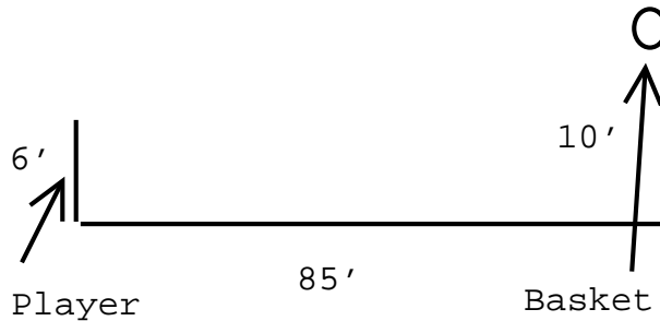
Figure 1: positions of the player and basket.

f. (1 point) Given your results from parts (d) and (e), what can you say about the minimum speed at which the player now must throw the ball in order to make the basket?